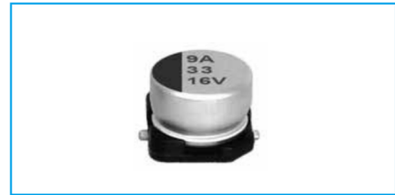
Marking color : Black print