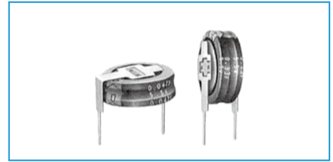
Marking color : White print on a black sleeve