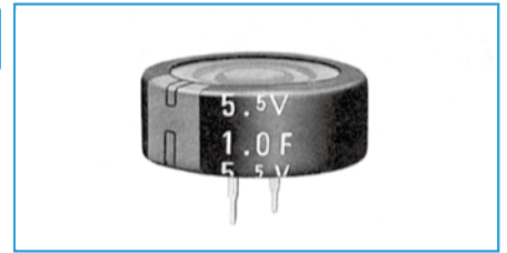
Marking color : White print on a black sleeve