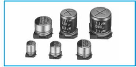
Marking color : Black print ( \phi 4 \times 5.3L - \phi 8 \times 6.5L , \phi 12.5 \times 13.5L ) : White print on a brown sleeve ( \phi 8 \times 10L - \phi 10 \times 10.5L )