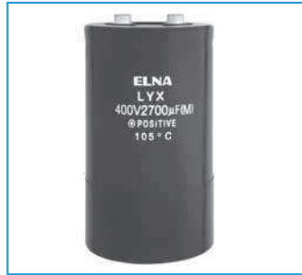
Marking color : Silver print on a black sleeve