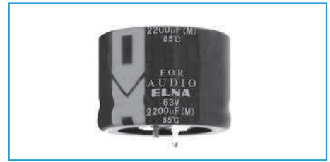
Marking color : Gold print on a black sleeve