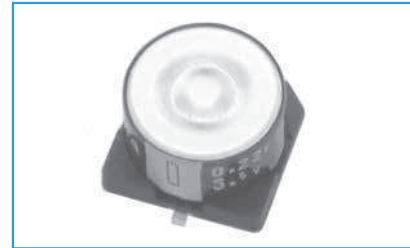
Marking color : White print on a brown sleeve